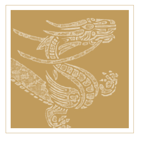
"Our approach, in the midst of what are admittedly absorbing macro discussions, has been to focus on finding good businesses, rather than try to speculate on events."