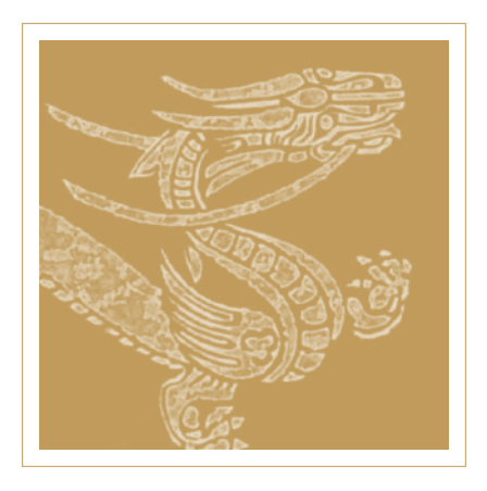
"We remain true to our philosophy of finding good companies that will grow over a sustained period of time."